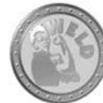
WOMEN FOR ECONOMIC AND LEADERSHIP DEVELOPMENT